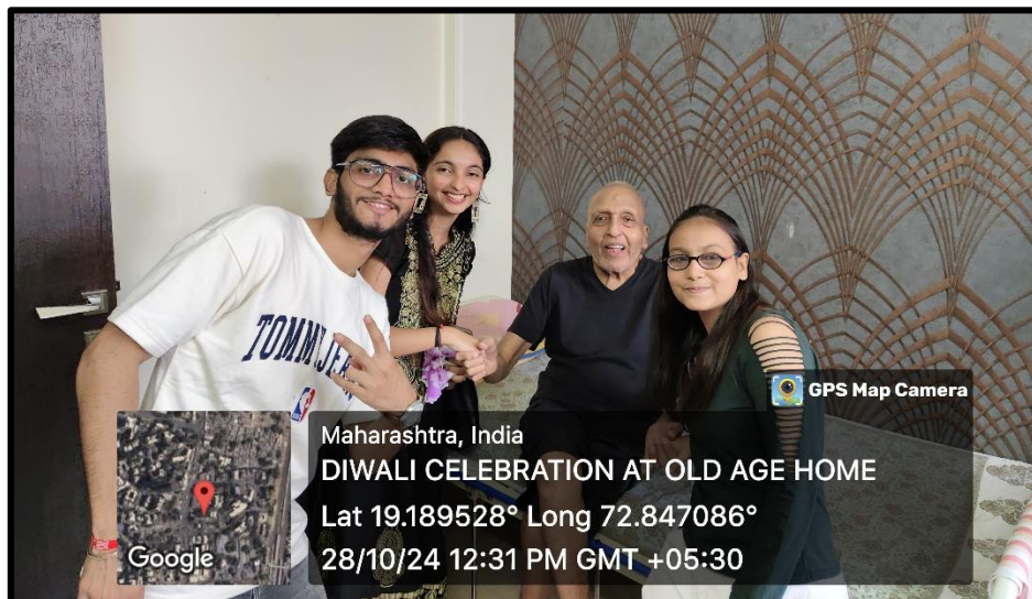
“The true glow of Diwali, found in laughter and joy”