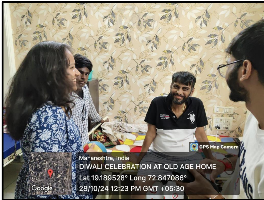
“The real light of Diwali radiates through the smiles and stories exchanged”