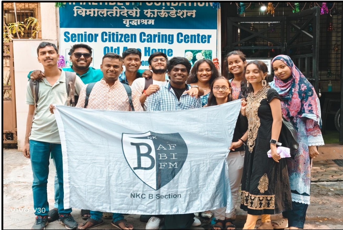
“Team B-Section: Spreading the light and love this Diwali”