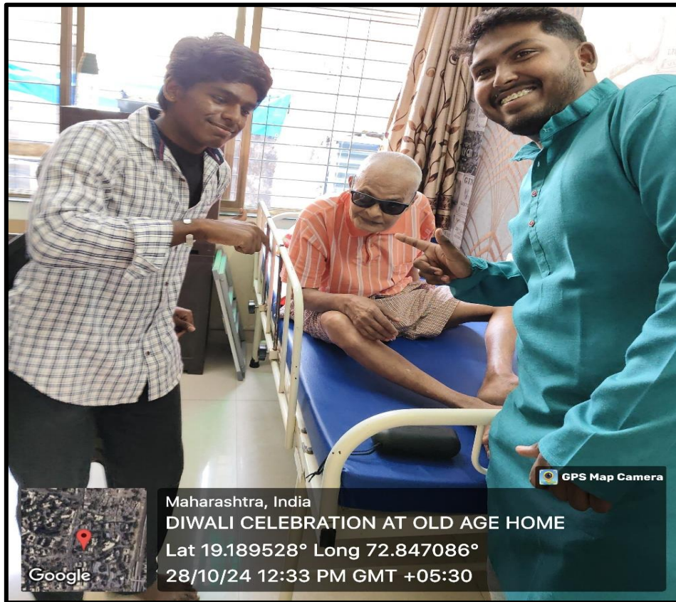
“Festive spirit, with the best company”