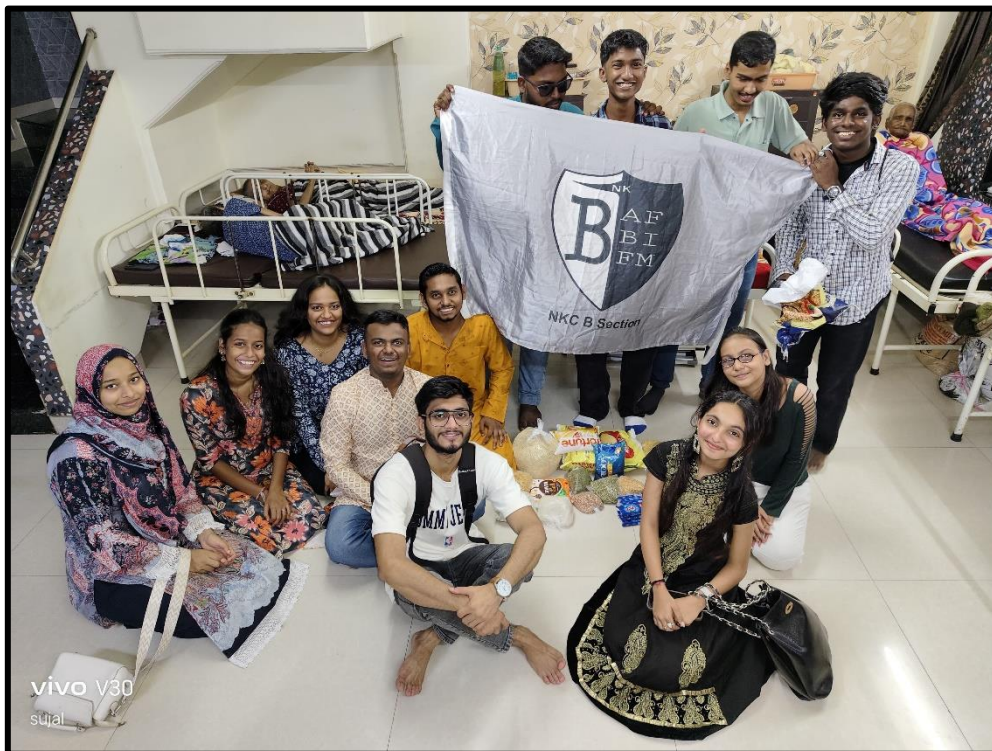
“Spreading festive warmth beyond the campus walls”